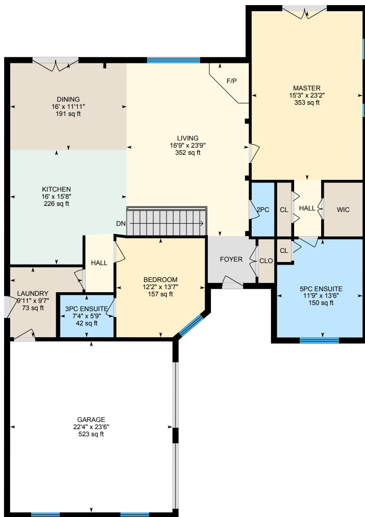
1st Floor Exterior Area 2014 sq ft

Main Building: Total Exterior Area Above Grade 2014 sq ft